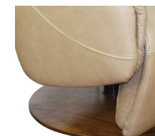
WALNUT WOOD PEDESTAL OPTION