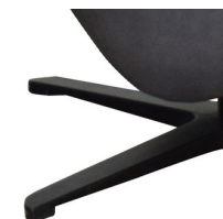
BLACK ALUMINUM PRONG BASE OPTION