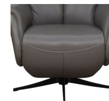
BLACK METAL BASE OPTION